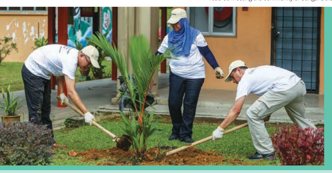
Over 8,500 volunteer hours were recorded through programmes organised by our corporate functions and operational teams, in 2015.

In addition, the Gombak Public Works Department (JKR), in partnership with Lafarge Malaysia, upgraded a 1.1km road in Rawang, using the Cold-In-Place Recycling (CIPR) method. This method recycles existing road materials by mixing them with cement-based materials as a sub-base to make the road stronger and more durable. Lafarge Malaysia provided technical expertise and contributed more than 7,500 bags of cement worth RM150,000. The road, Jalan B25 Bristol-Kuang, is an important road connecting the community of Sungai Buloh with Rawang.